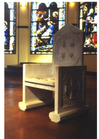
Presider's Chair from Antique Marble Altar