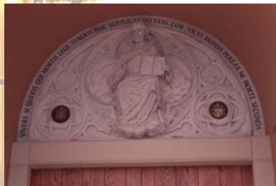
Tympanum of Christ in Glory