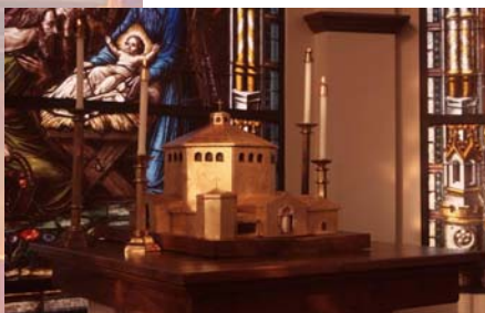
Tabernacle as Church

The baptistry takes the ancient octagonal form, and is sunken three steps to represent Jesus' three days in the tomb. Each element of the building is articulated in a harmonious integration of form, creating a true sense of the "church", both as the "community" and as the "sacrament".