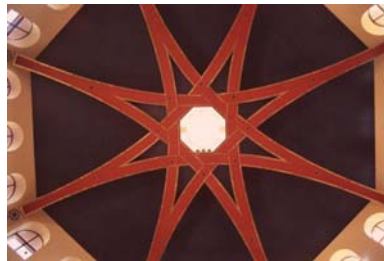
Ceiling Pattern of Mystical Rose