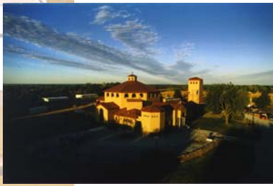
Aerial view from South West