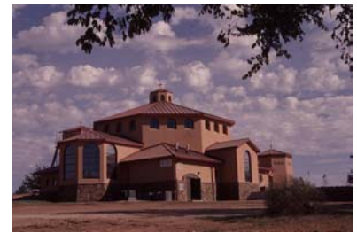
View from North West